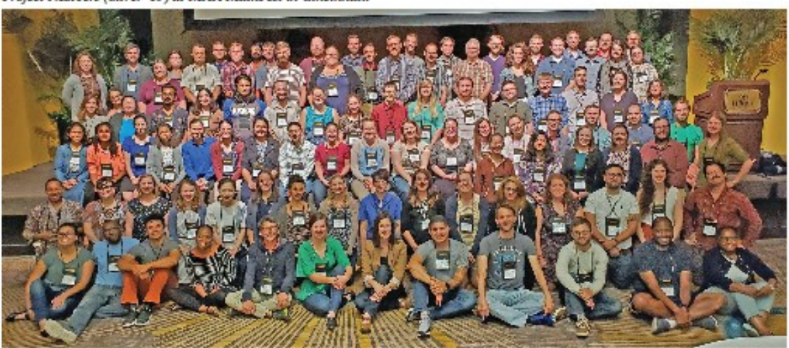
Project NExTers (Silver '19) at MAA MathFest in Cincinnati.

Application deadline: April 15, 2020 projectnext.maa.org • projectnext@maa.org