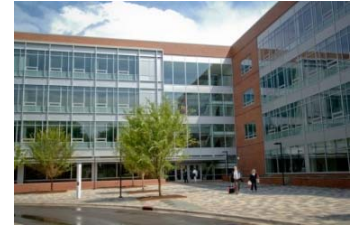
SAS Hall, opened 2009