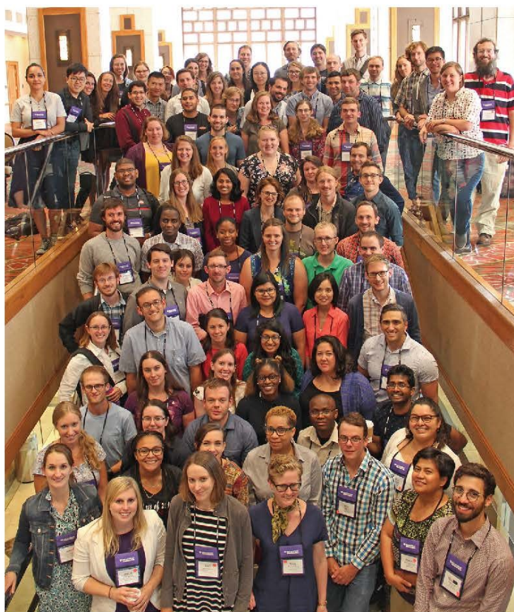
Project NExTers at MAA MathFest in Denver.

MAA Project NExT welcomes and encourages applications from new and recent PhDs in postdoctoral, tenure-track, and visiting positions. We particularly encourage applicants from underrepresented groups, including women and minorities. Applications for the 2019 cohort of MAA Project NExT Fellows are due on April 15, 2019 and can be found at projectnext.maa.org .