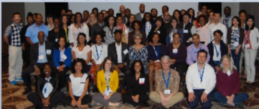
2016 Workshop Attendees

Lunch will be provided for all registered participants. Travel reimbursement is available. Registration is required for consideration.